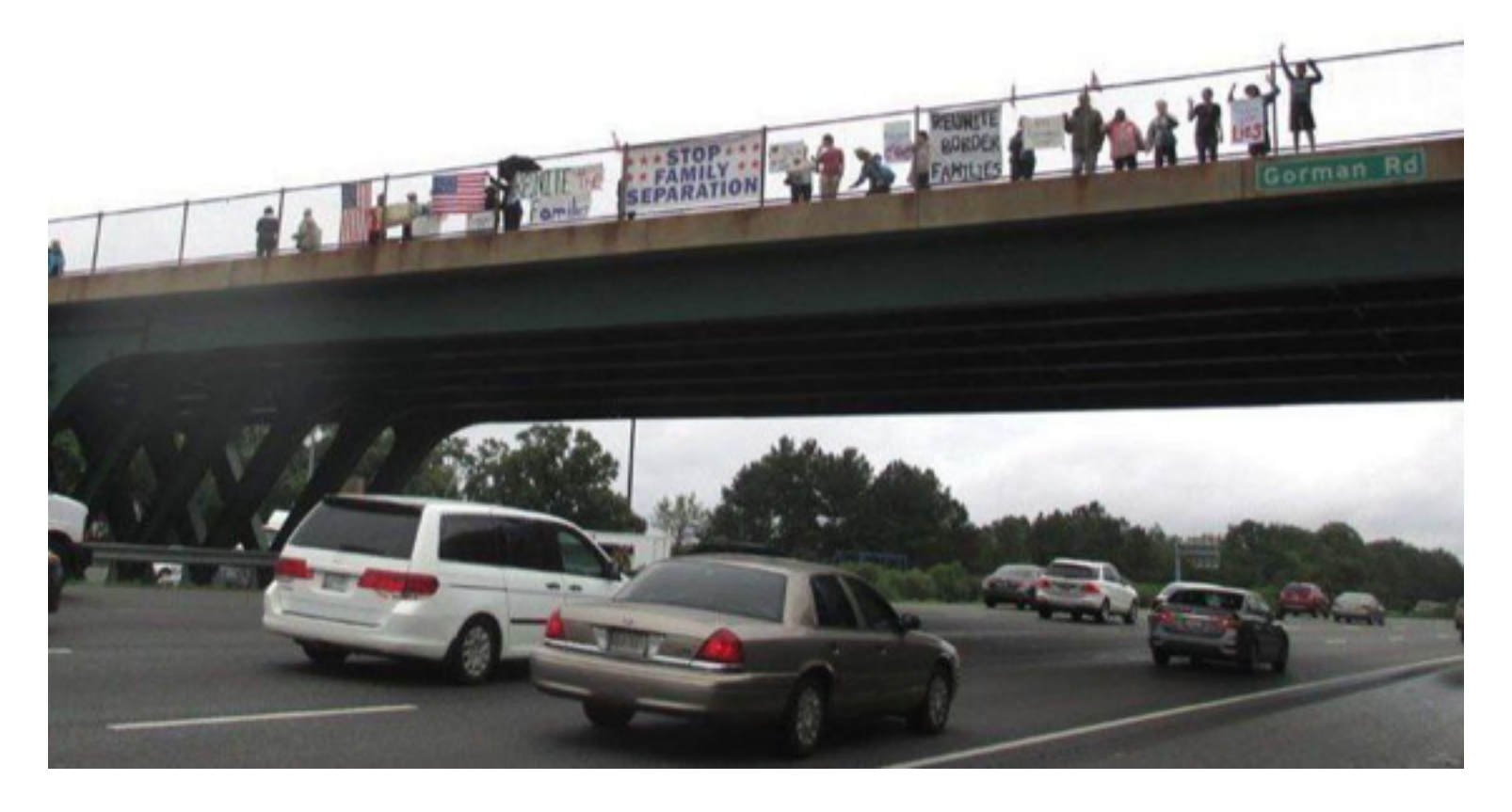
IndivisibleHoCoMD Immigration Team